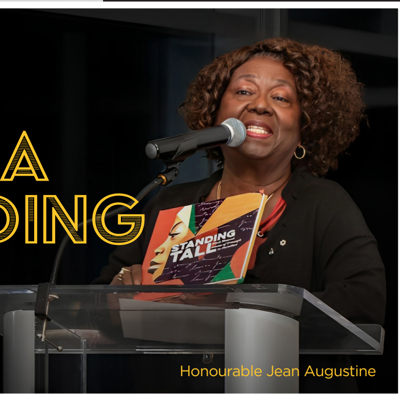
Honourable Jean Augustine